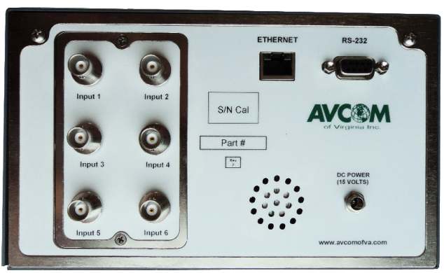
(Rear view of SNG-2500C-6BL)

Designed for satellite news gathering, the SNG is an excellent, cost effective upgrade to the discontinued Tektronix 1705A with a feature set that is second to none, giving the Satellite Technician a very useful tool for finding and peaking on satellites. The SNG is not only a spectrum analyzer but also a carrier monitor. The SNG also offers L.O. Frequency Offsets which allows the operator to display the frequency in L-Band, C-Band, Ku-Band, or any custom band needed.